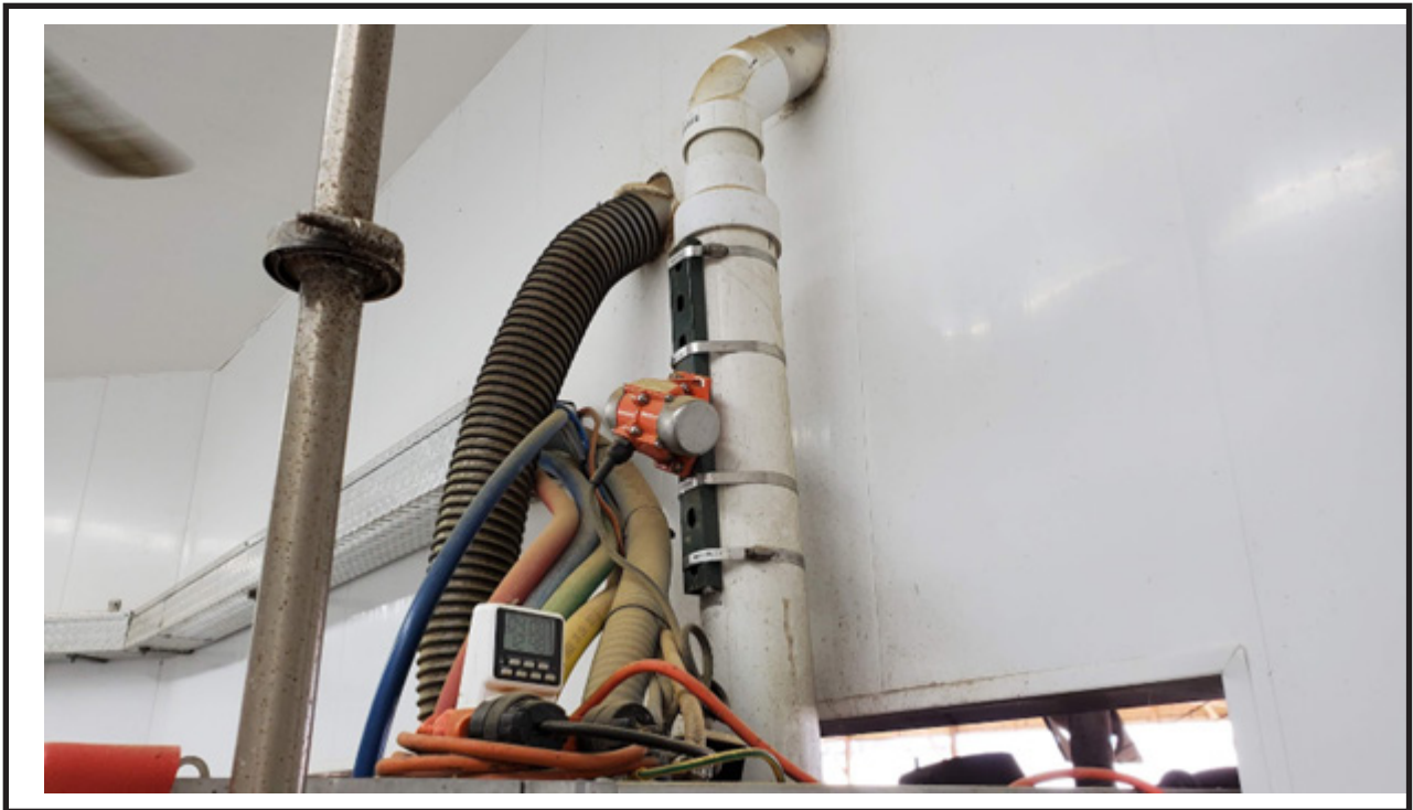
Figure 1. A vibratory apparatus to aid in feed flow of non-pelletized feed in an automated milking system feeder.